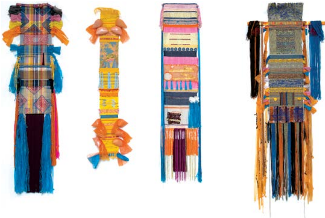
BEST OF SHOW KAITLIN SHAE Cosmic Figures Series $2,000