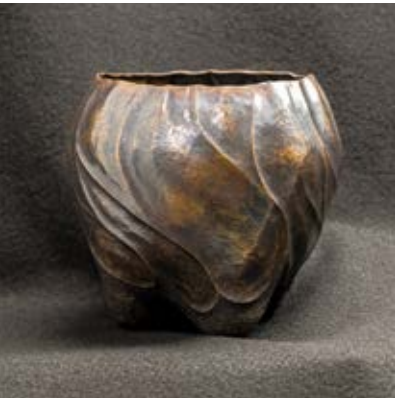
3RD BEST OF SHOW FRANCO RUFFINI Contorto $500