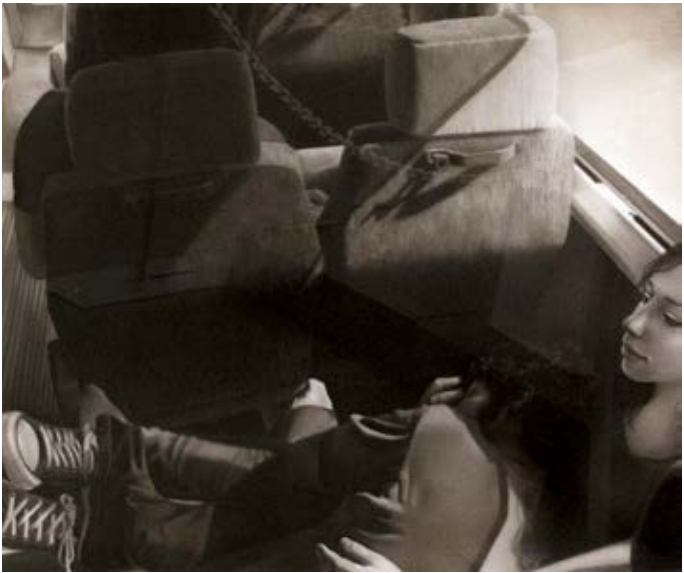
PROFESSIONAL LINDSAY RODGERS The Ever-Youthful Mercury Bird $600