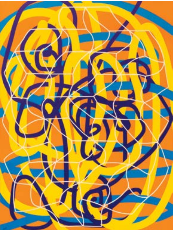
PROFESSIONAL JAMES MARCH Quantum Space $600