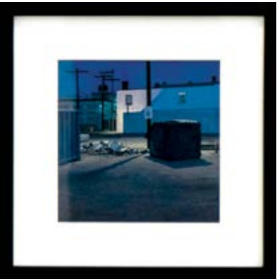
3RD BEST OF SHOW CHRISTOPHER BURK Nocturne Lot $1,000