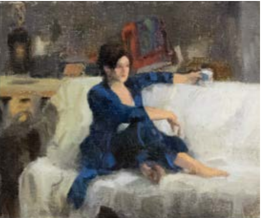
AMATEUR SUSAN CORCORAN Late Winter Light $400