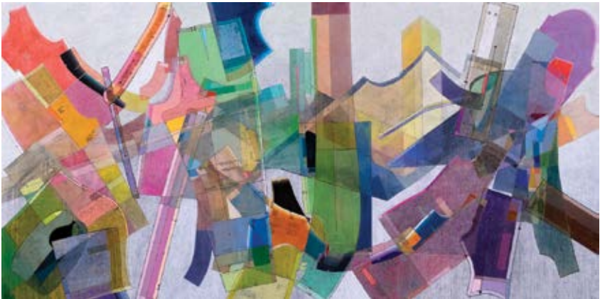
2ND BEST OF SHOW NIKOS RUTKOWSKI Elegy for the Republic $1,400