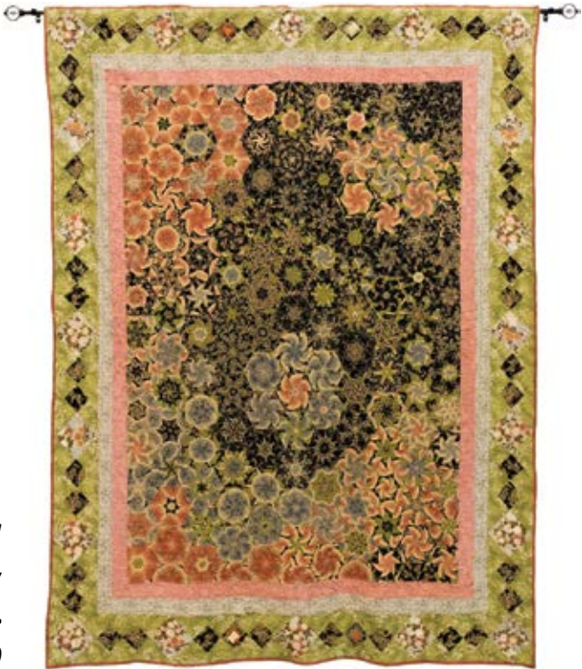
BEST OF SHOW TERRI MCCARTY Kaleidoscope $1,000