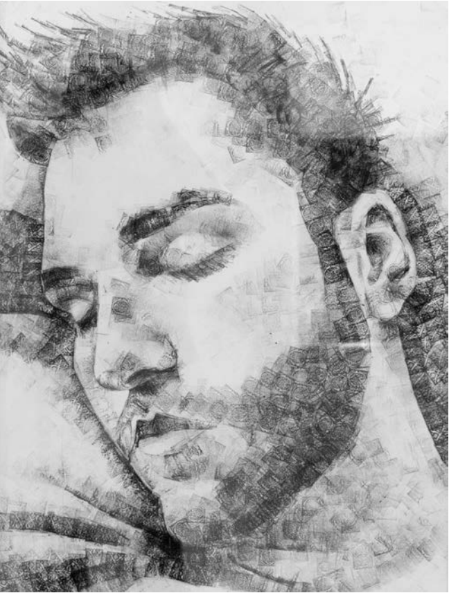
Neptune, Troy Dreaming Of Love XOXO