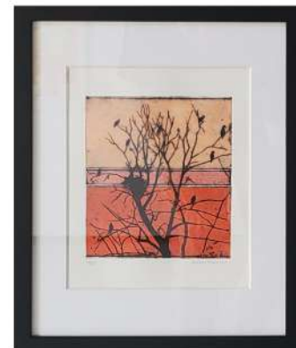
Above: 2023 Professional Best of Show Evie Zimmer, Wonderlust